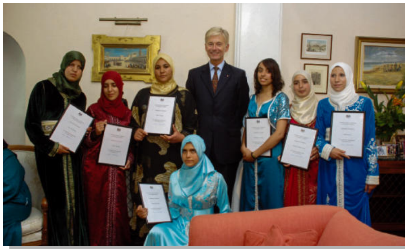
With the British Ambassador in Rabat, June 2013

https://www.gov.uk/government/world-location-news/supporting-education-for-girls-in-morocco