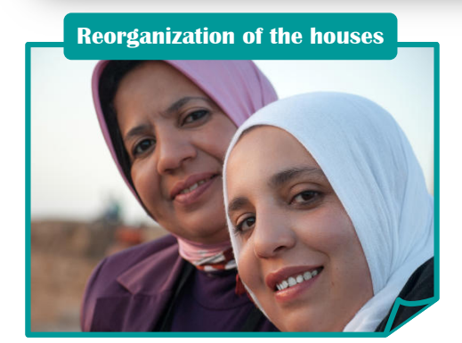
A 4th house means changes and an expansion of the staff of Education For All.